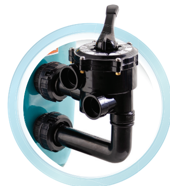
Side multiport valve