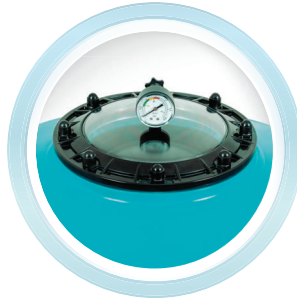
Transparent bolted lid (Optional) (Patented)