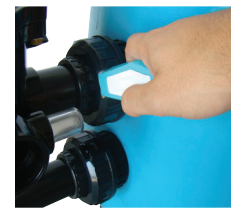
Couplings compatible with d50 Fitvalf ball valve handle